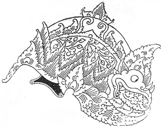
topong makutha, according to Sulardi, Surakarta