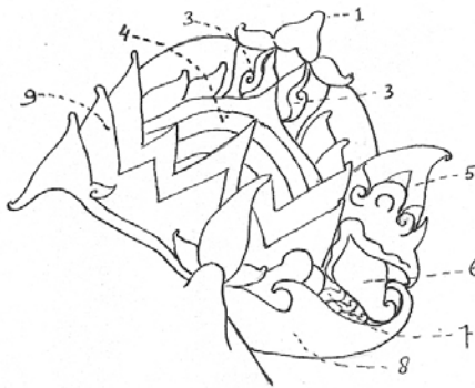
topong, volgens Sukir