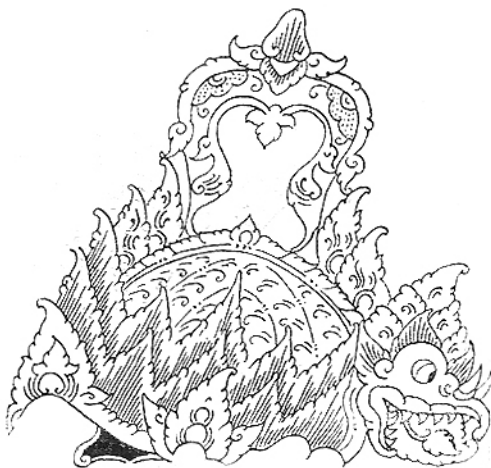
makutha, according to Sulardi, old Surakarta style